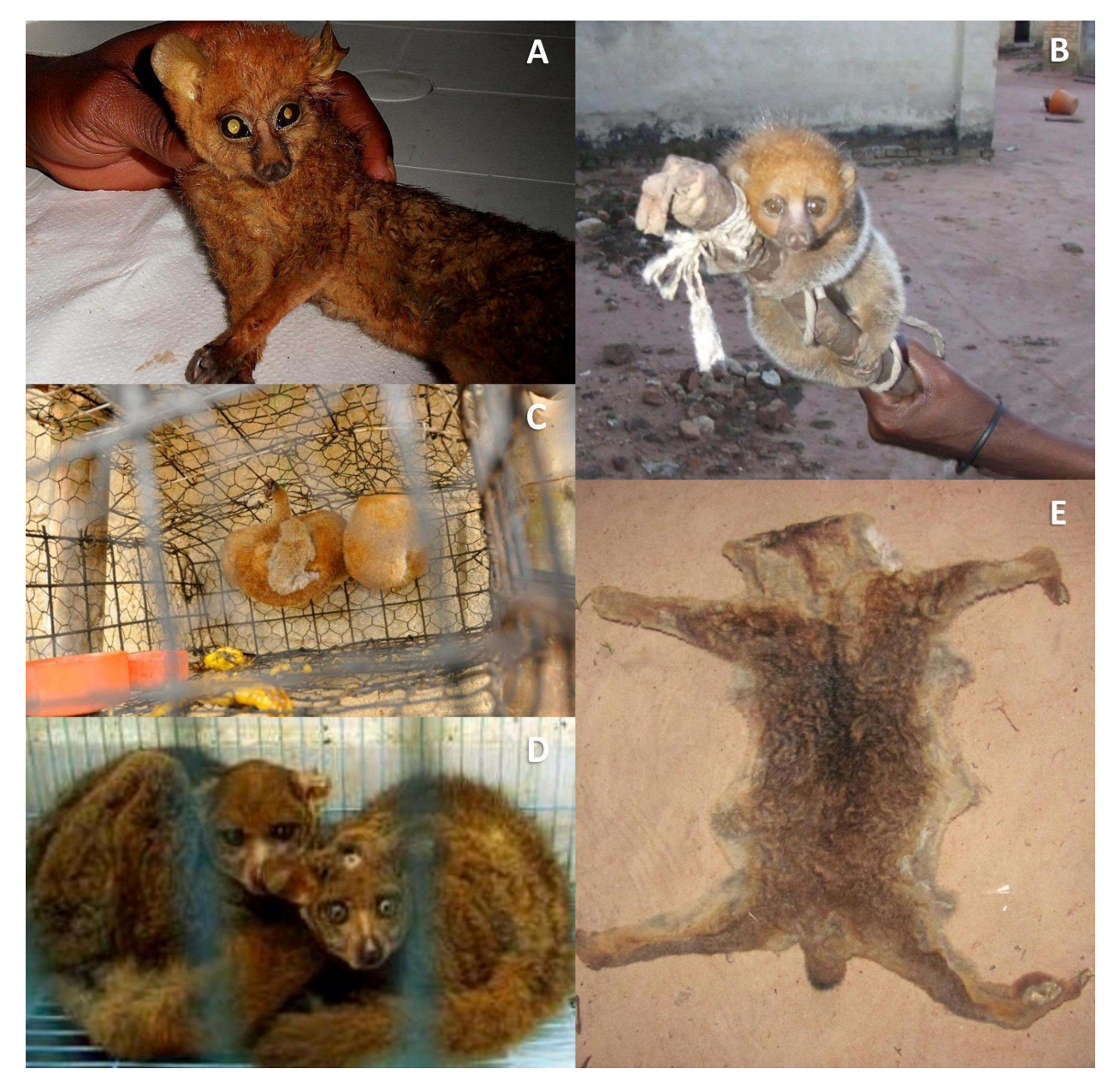
Figure 3 – (A) Arctocebus aureus hunted for bushmeat in Republic of Congo in 2010. (B) Infant Perodicticus ibeanus in the pet trade in Northern DRC in 2008. (C) Family of A. calabarensis kept as pets in Cameroon in 2012. (D) Otolemur garnettii for sale as pets in United Arab Emirates in 2009. (E) Skin of P. ibeanus for sale in Lusambo area, DRC in 2014.

epilepsy (Zambia: Baskind and Birbeck, 2005). The traditional practices using African lorisiforms described in the literature and by the respondents refer mainly to current practices and beliefs.